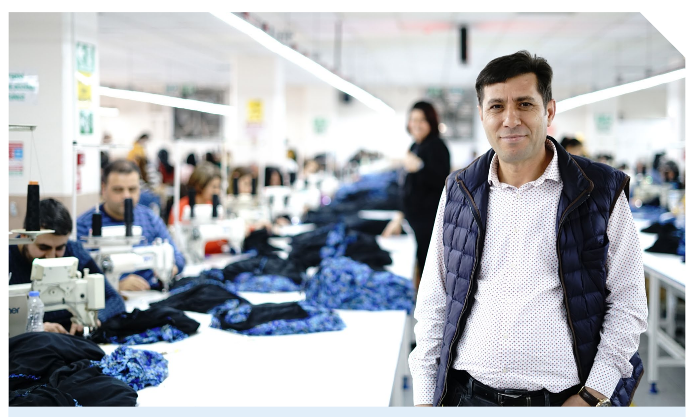
Owner of a garment factory in Istanbul, Türkiye.

Since then, the TISK has held the Turkish government accountable for its policies and highlighted in the media that, for example, the Work Permit Regulation was ineffective. It warned that "companies using Syrians as cheap labor have an unfair advantage over other businesses" (Al-Monitor 2016), and that child labour, which had been eradicated in Türkiye, was resurging among refugee communities (Reliefweb 2016). The TISK's latest publication is the 2020 report on the Integration of Migrants into the Turkish Labor Force, which was produced with the support of the Confederation of Danish Industry (DI). The report provides updated figures on the labour market outcomes of Syrian refugees in Türkiye, as well as on employers' relations with Syrian employees and their perceptions of them. Overall, the report underscores the importance of refugees' labour market integration but warns that the competition for economic resources between Syrians and Turks has a detrimental effect on social cohesion: "48 per cent of the general population in Türkiye define the relationship between Turks and Syrians as a very hostile relationship, 55 per cent do not wish their child to have a refugee friend" (TISK 2020).